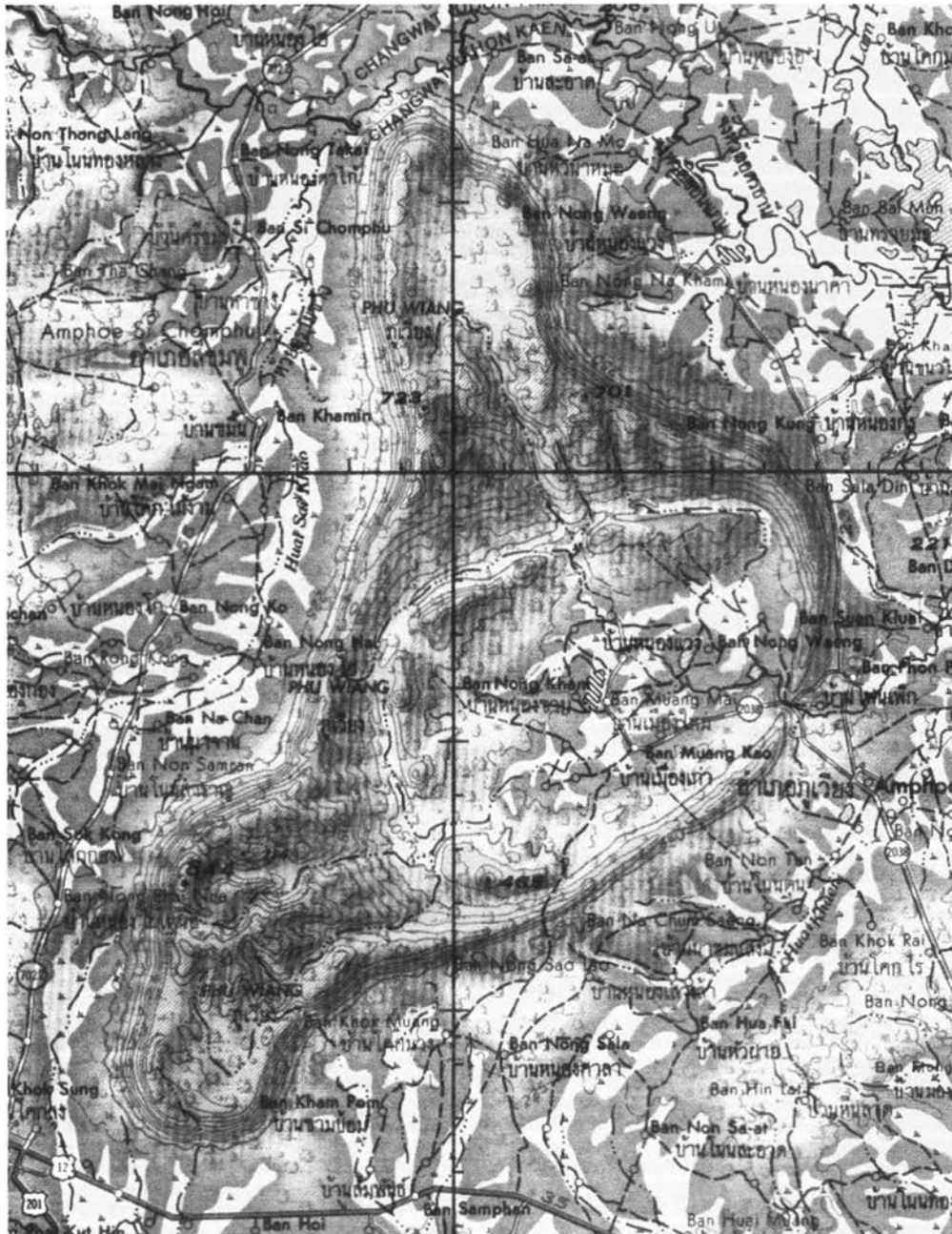
Figure 1.2 The topography of the Phu Wiang area