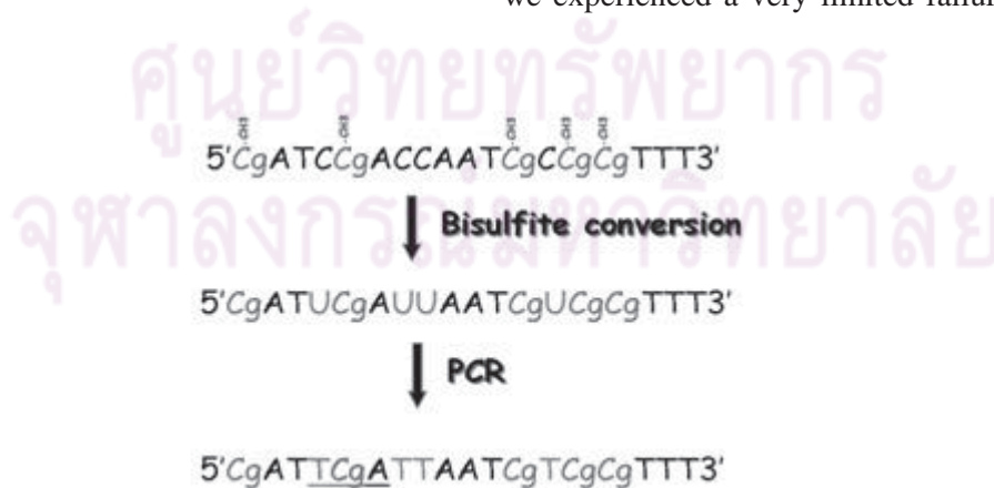
Fig. 1 Schematic representation of DNA sequences. From above to below, the sequences were methylated DNA, bisulfited DNA and bisulfited DNA after PCR, respectively. Bisulfite reaction converted unmethylated cytosines to uracils but methylated cytosines were not changed. After PCR, uracils were amplified as thymine. The underline nucleotide represents sequence that was digestible by TaqI .

We developed a PCR-based analysis for quantifying the genome-wide level of methylation to improve upon the conventional Southern blot and hybridization approach [3]. Southern blot requires large amounts of DNA and consequently it is difficult to analyze tumor DNA derived from micro-dissection. We applied a modified COBRA PCR protocol to efficiently and quantitatively evaluate LINE-1 methylation status in the entire genome of isolated cell populations. This new protocol targets shorter amplicon sizes of the widely distributed LINE-1 sequences, which greatly improves the yield when amplifying genetic material derived from micro-dissected paraffin-embedded tissue. Interestingly, based on our experience, DNA from paraffin-embedded tissue is difficult to be amplified by conventional PCR methods [34, 35] because DNA is usually degraded by formalin [34]. Interestingly, we experienced a very limited failure rate of PCR