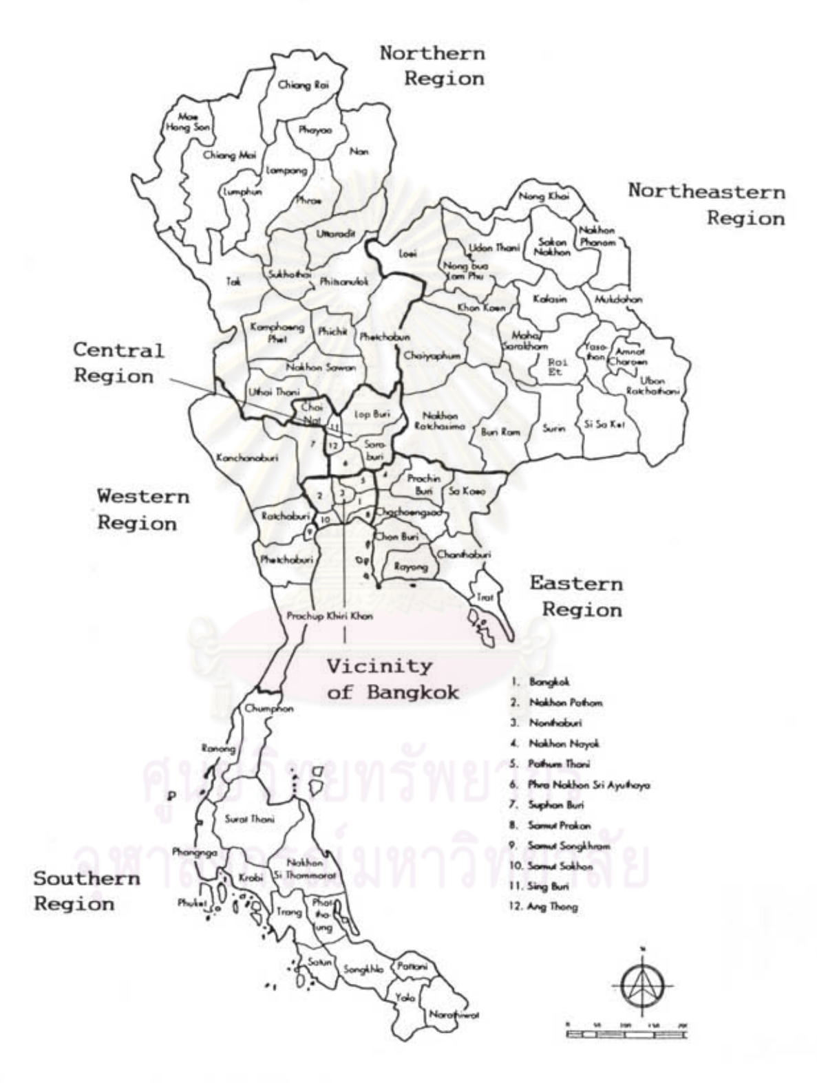
Figure 2.1 Geography of Thailand