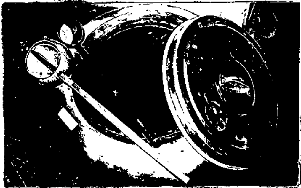
Figure 2. Water Jar and Ladles.

Each jar was inoculated to a final concentration of approximately 10^4 of each organism per milliliter using ten milliliters of 18 hours infusion broth cultures of Salmonella typhosa , Shigella flexneri type III and Vibrio cholerae El Tor-Ogawa . The jars were kept at room temperature and covered with aluminum lids (See Figure 2).