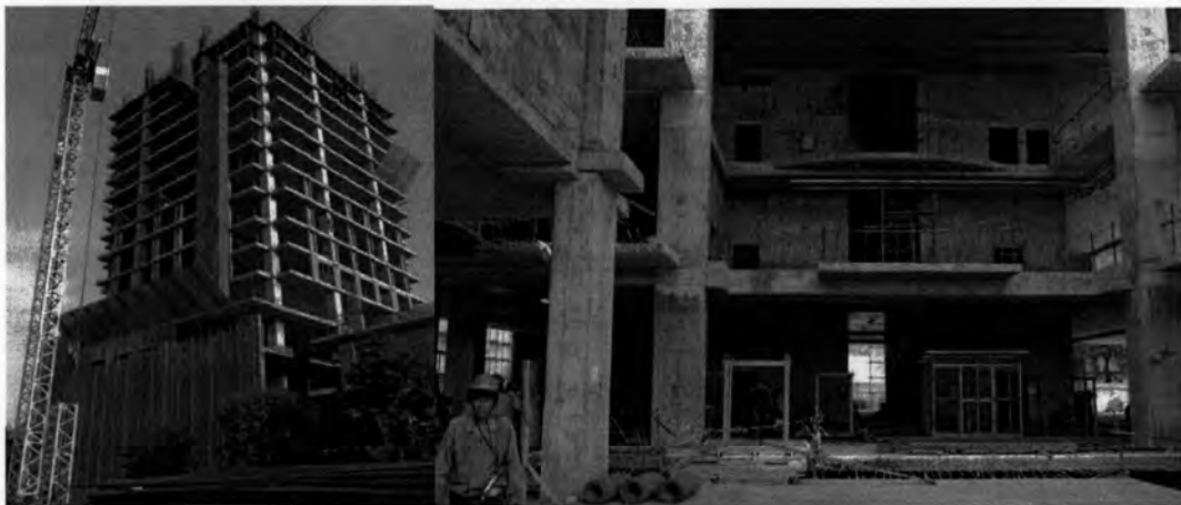
Figure 4-1 High-Rise Building Project in Phnom Penh

In Phnom Penh city, there are lots of housing buildings consisting of apartment buildings or flats. They are built everywhere, especially in the suburb of Phnom Penh. Some developers are tycoons who have bought empty land or some old and small houses and developed them into new commercial buildings for resale in real estate business. Not only is the commercial buildings construction booming, but also large projects such as condominium construction and small town development which are called economic zone development are the main recent construction involved in the Cambodian construction industry nowadays. All of these have indicated the trend of construction industry and buildings in Phnom Penh for the last few years and in the near future.