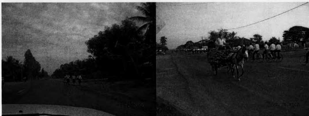
Figure 4-9 National Road and Housings along the road from Phnom Penh to Siem Reap

People do not pay much attention to cars on the road; they let their animals cross this national road at their own will. This indicates the lack of traffic precaution in provincial areas. Most people in provincial areas usually use wood as materials for housing construction.