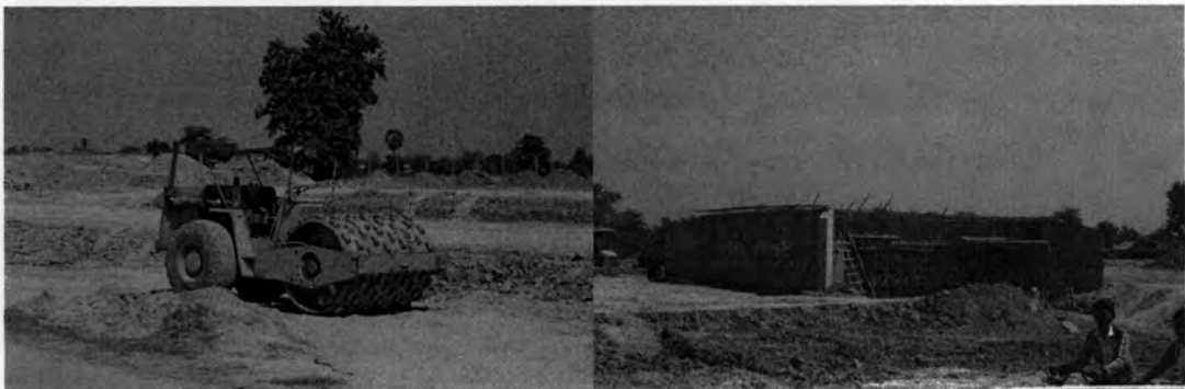
Figure 4-7 Road Rehabilitation Activities in Suburb of Phnom Penh

For the problem about labor, some contractors need of skilled labor working on site. Some of workers are selected from the local area where the project is located for example, brick-layering workers, painters, steel binders, but sometimes they are needed to get training before placing on the job. Only 20% of them are selected from the main office in the capital city, like site engineers, skilled carpenters, supervisors, etc,