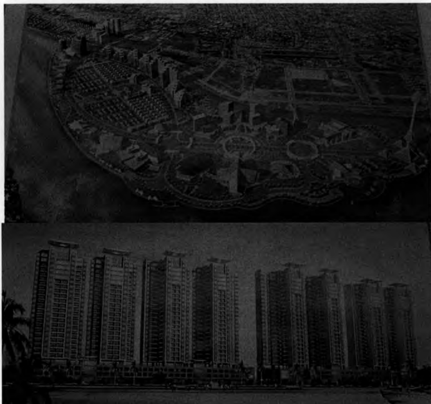
Figure 4-5 The Large Project Plans on an Island in Phnom Penh, Cambodia