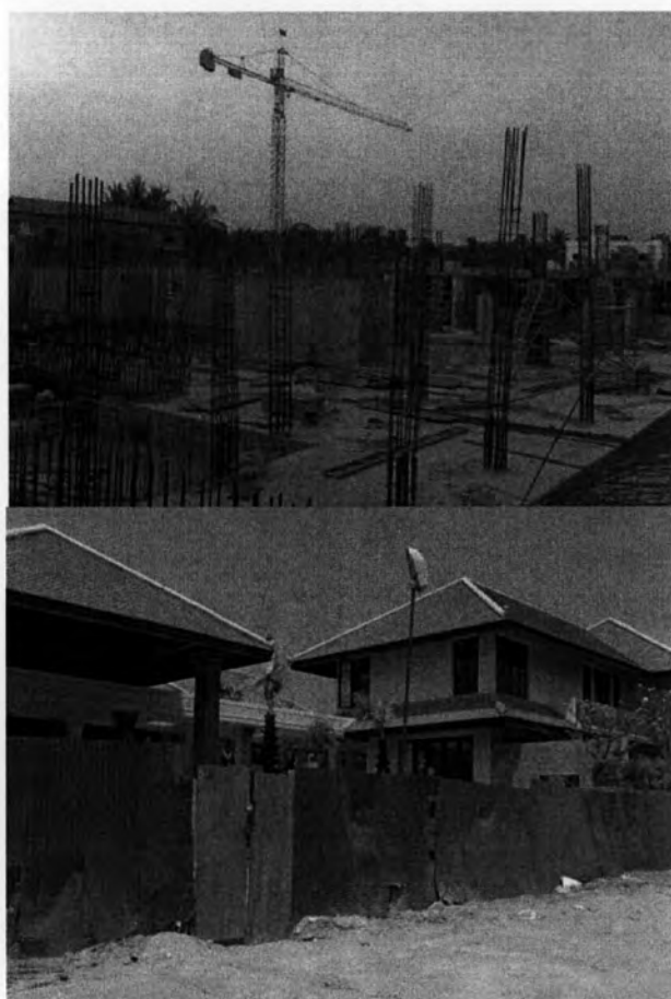
Figure 4-10 Construction Site of Five-Star Hotel in Siem Reap