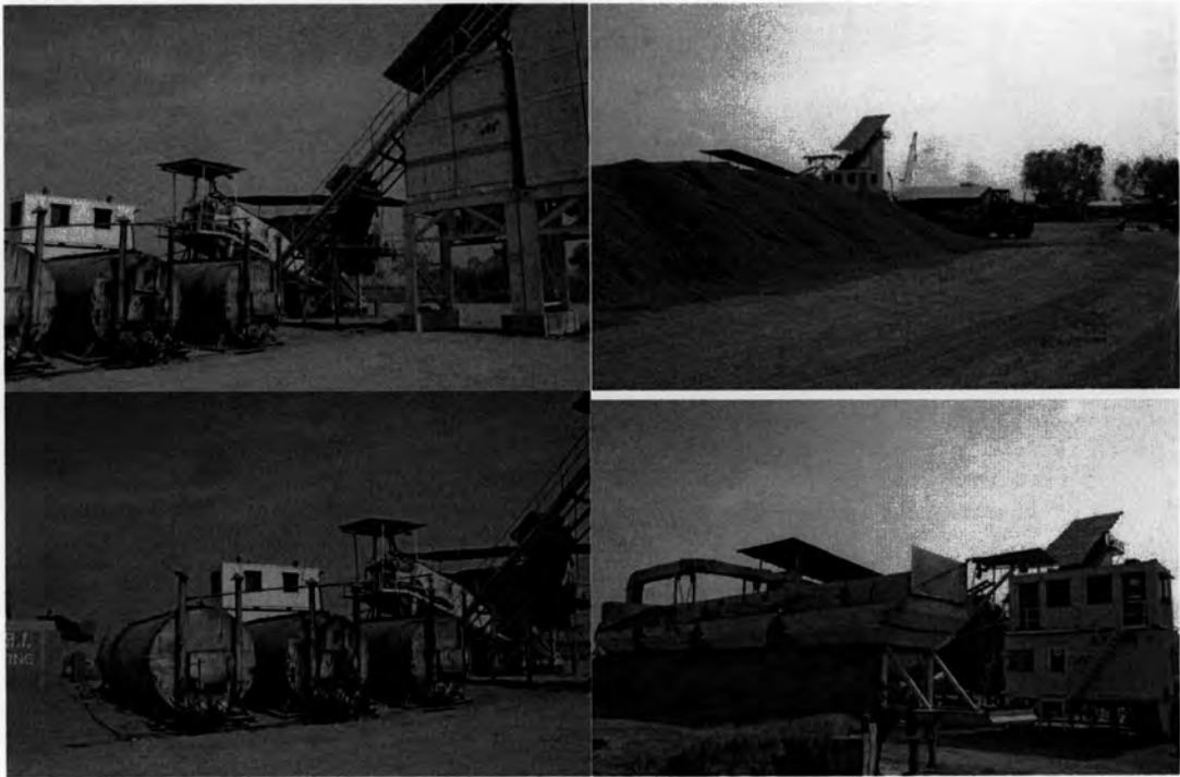
Figure 4-6 Construction Site of Phnom Penh Airport Pavement Projects

For the problem about labor, some contractors need of skilled labor working on site. Some of workers are selected from the local area where the project is located for example, brick-layering workers, painters, steel binders, but sometimes they are needed to get training before placing on the job. Only 20% of them are selected from the main office in the capital city, like site engineers, skilled carpenters, supervisors, etc,