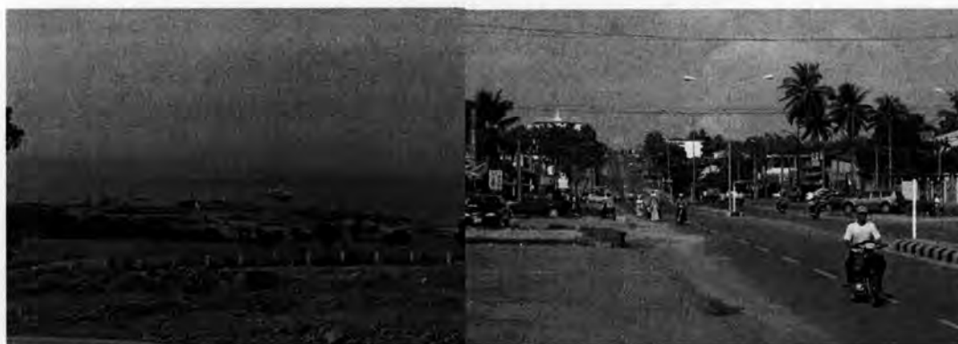
Figure 4-11 International Port and Housing Bird View in Sihanoukville

Construction industry in Sihanoukville has not yet grown as much as those in Phnom Penh and Siem Reap, but it have significantly grown since the last few years. Some hotels have been recently built in this city. The main road in Sihanoukville has just been rehabilitated in recent years funded by the government.