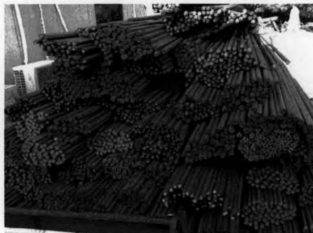
Figure 4-2 Steel – Imported Material for a High-Rise Building Project