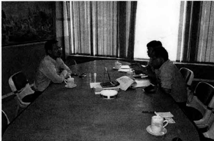
Figure 4-4 Picture of Interviewing with a Foreign Construction Company from Malaysia