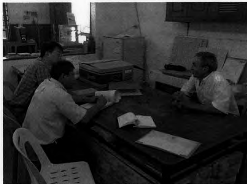
Figure 4-8 Picture of Interviewing with Foreign Contractor in Siem Reap

This indicates that the construction industry in Siem Reap is also the main area to study for a careful planning. The study also includes the labor force and material suppliers to support any projects around the city.