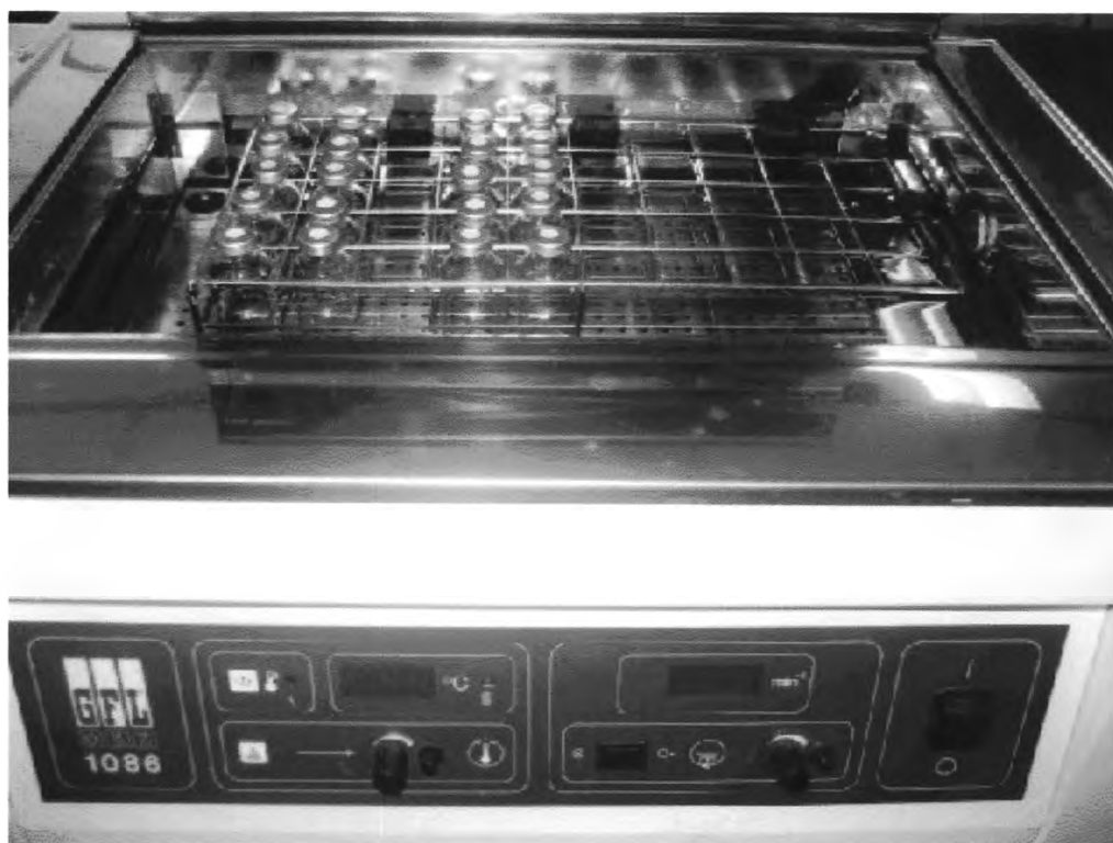
Figure 3.1 Heat activated persulfate oxidation system

The heat activated persulfate oxidation system was made up of 50 mL crimp seal vials with aluminium seal and silicone Teflon septa, and a shaking water bath illustrated in Figure 3.1. A shaking water bath was used for temperature control and mixing. All experiments were done in triplicate. Control tests were conducted in parallel.