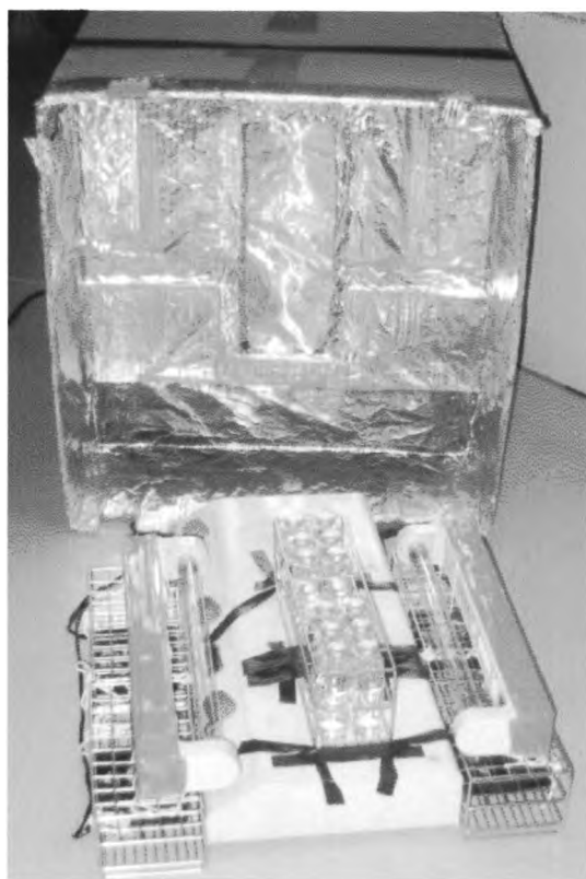
Figure 3.4 UV activated persulfate oxidation system

(1=UV lamp, 2=Sample vial, 3=Magnetic stirrer, 4=fan)