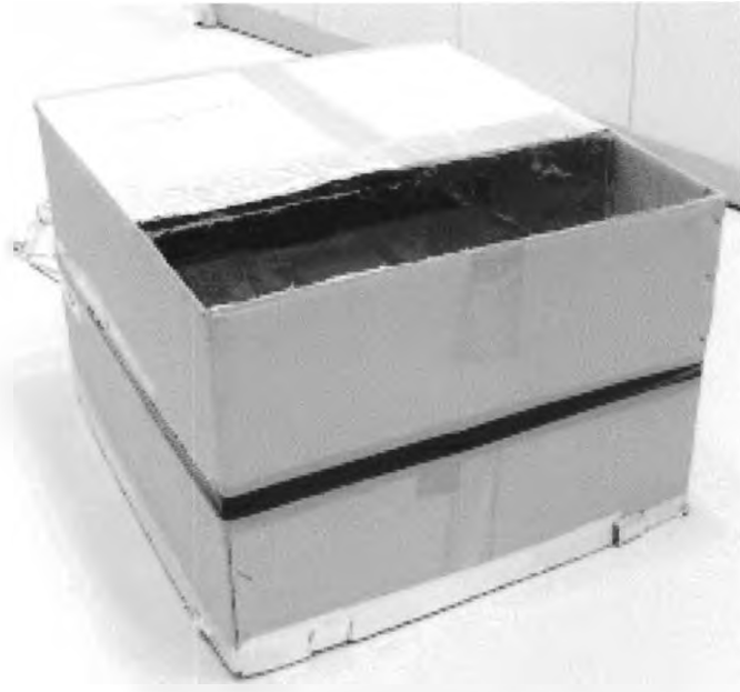
Figure 3.5 UV activated persulfate oxidation system (covered system)