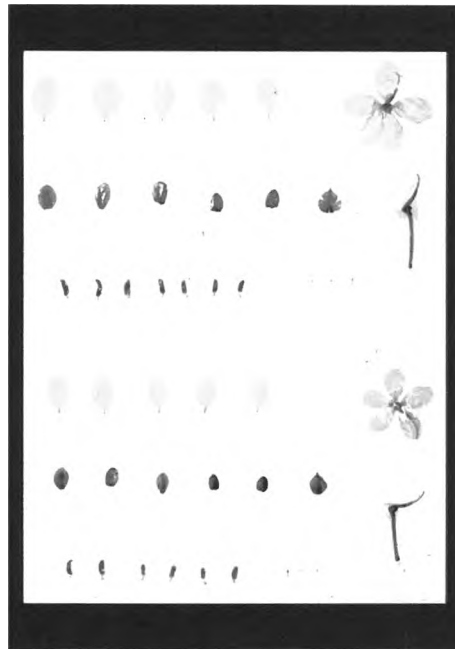
Figure 4.2 Preparation of dried plant specimens for measurements by digital caliper

Factor analysis was applied with no a priori grouping of specimens. First, all variables were standardized and the correlation matrix for all variables was computed. Then, in factor extraction, linear combination was calculated by principal component analysis (PCA) in order to find the number of factor. To transform complicated matrices into simpler matrices, factor rotation will be made. Finally, scores for each factor can be computed for each case. Procedure Data Reduction and Factor in SPSS/PC for Windows, release 9.0 (Anonymous, 1998) were used to run PCA.